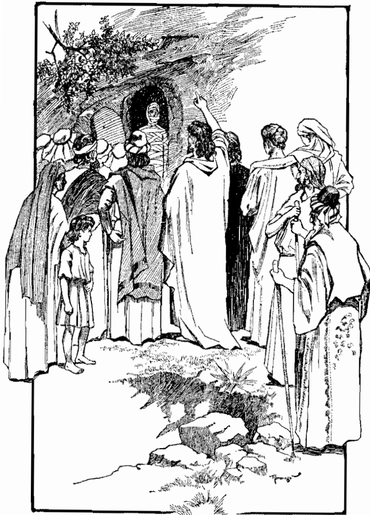
The Raising of Lazarus

Arise. And he that was dead sat up, and began to speak." Luke 7:14, 15.