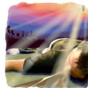
The living wicked will be slain by the brightness of Jesus' second coming.

Answer: The living wicked will be slain by the very presence of Christ at the second coming. When an angel appeared at Jesus' tomb, the entire group of Roman guards fell as dead men (Matthew 28:2, 4). When the brightness of all the angels, God the Father, and God the Son combine, the wicked will die as if hit by lightning. The wicked already dead when Jesus returns will remain in their graves until the end of the 1,000 years.