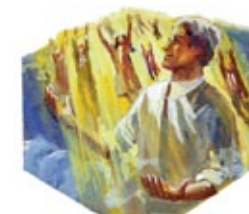
A devastating earthquake and hailstorm will strike the earth at Jesus' second coming. At that time the righteous of all ages will rise to meet Jesus in the air.