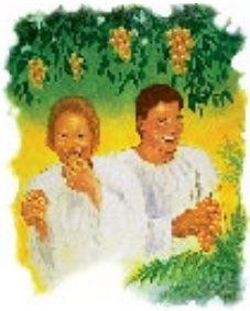
The righteous will be in heaven with Jesus during the 1,000 years.