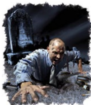
The 1,000-year period ends at the resurrection of the wicked.

Scripture taken from the New King James Version®. Copyright © 1982 by Thomas Nelson, Inc. Used by permission. All rights reserved.