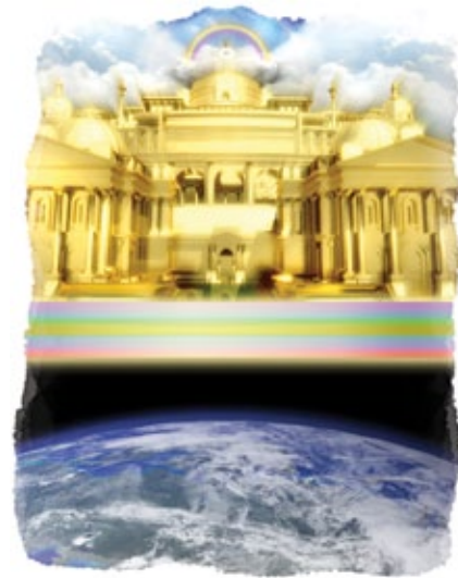
The holy city, along with all God's people, will descend to earth at the close of the 1,000 years.