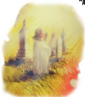
The 1,000-year period begins at the resurrection of the righteous.

Answer: A resurrection begins the 1,000-year period.