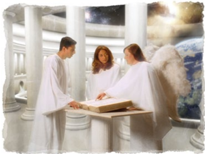
During the 1,000 years, all God's righteous people will participate in the judgment in heaven.

During the 1,000 years, every soul who has ever lived on earth will be in one of two places: (1) on the earth, dead and lost, or (2) in heaven, taking part in the judgment. The Lord invites you to be in heaven. Please accept His invitation.