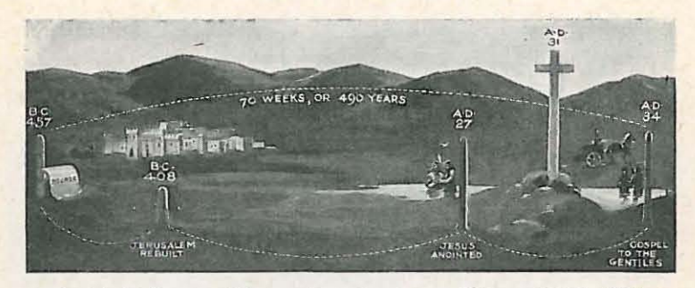
A pictorial diagram of the seventy weeks of years (490 years) of the 2300, reaching from 457 B. C. to 34 A. D.

We begin our consideration of this time prophecy with the period of 483 years, which were to reach to the appearance of the Messiah. The words of the angel to the prophet are: