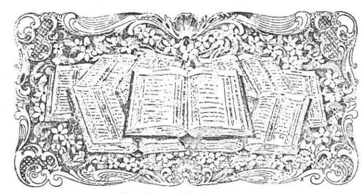
THE BOOKS WERE OPENED.

type, and hence nothing of this kind could occur in the antitype. Of course there is an almost infinite difference between earthly things and heavenly. The law, said Paul, had not the very ineage of the things to come, but only a shadow of them. Heb. 10:1. Men, back there, could not read hearts, and so could not judge individual cases. The work in the type could, therefore, only be general in its character, an offering for the whole congregation. But the people had individually to afflict their souls while the high priest was officiating for them, or lose the benefit of his work. It was, therefore, a work of the same nature, as far as it could be performed by mortal men; and it was certainly sufficient to prefigure the greater and more solemn work of judgment, which must take place, yea, must be even now taking place, in heaven.