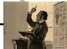
Second Advent Movement Rev 14:6,7