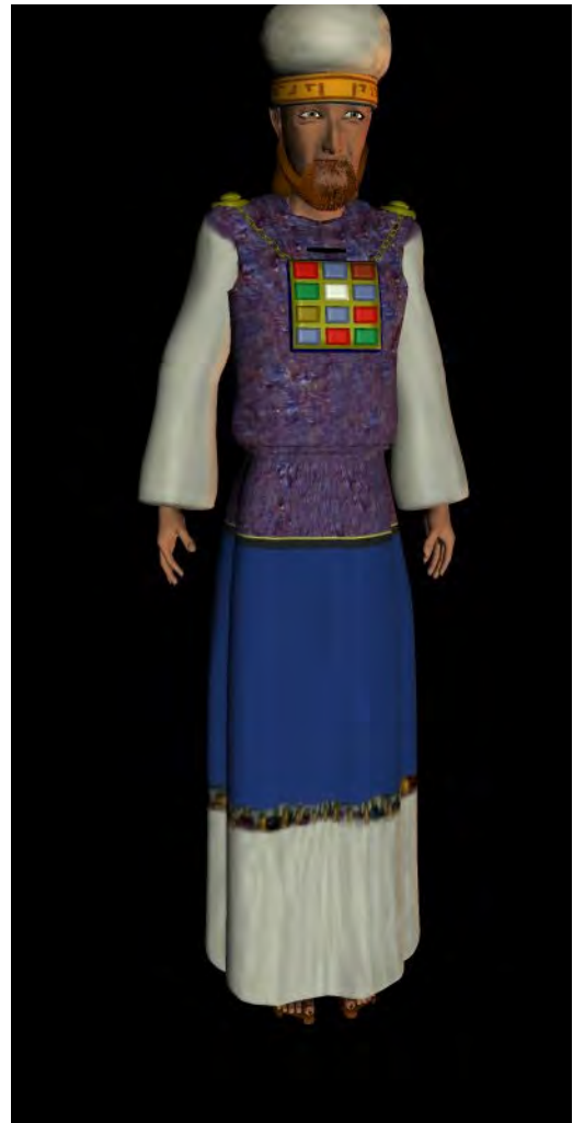
Robes of the High Priest

Upon the shoulder onyx stones the names of the children of Israel were engraved, not according to the order of the tribes around the tabernacle as was the case in the twelve stones, but according to