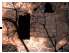
Christ in Tomb John 6:51; John 12:24