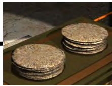
Unleavened Bread Nissan 15-21 First Month Lev 23:6-8