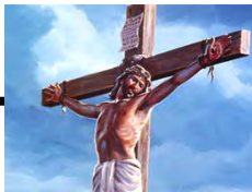
Crucifixion 1 Cor 5:7