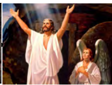
Resurrection 1 Cor 15:20