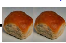
Feast of Weeks Sivan 6 Third Month Lev 23:15-21