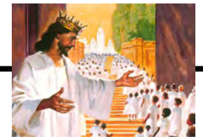
Homegoing at Second Advent Rev 14:14-16