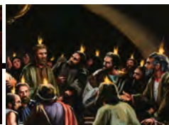
Pentecost Acts 2:1-4; Rev 5:6