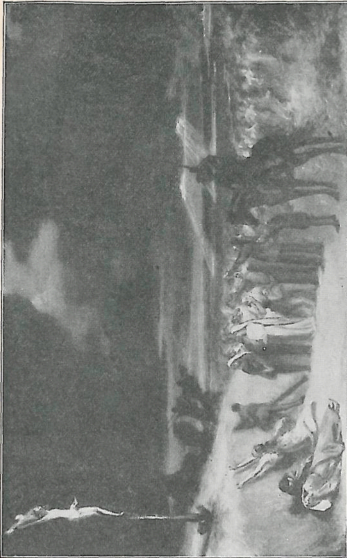
Christ is the hope of the world.

The relief of the present degradation and desolation of the world lies in the coming of this divinely appointed Leader, to take the government upon His shoulder, to rule and reign in righteousness; for then, and not till then, will every world problem find its final solution. Whether men realize it or not, the coming of this Promised One is the only arrangement that