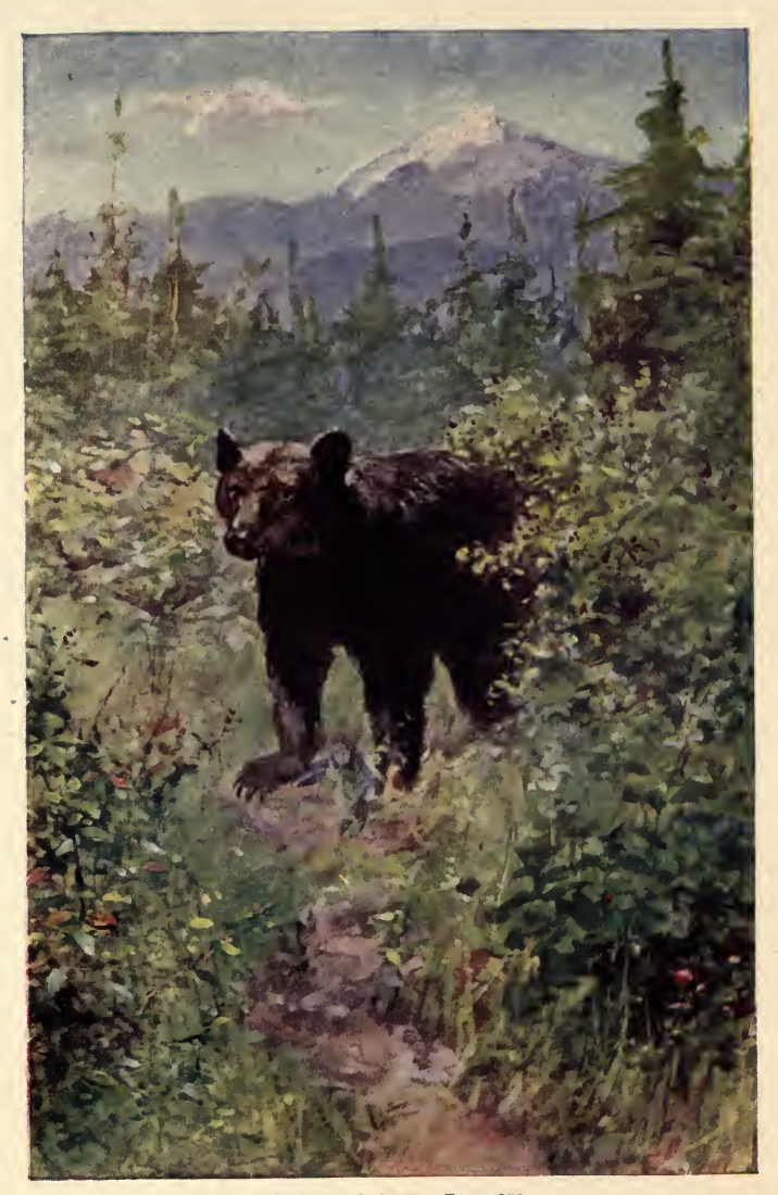
Large Black Bear.—Page 250.