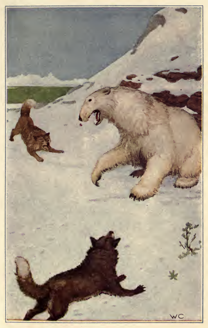
Pressed more severely, the bear stands at bay.—Page 155.