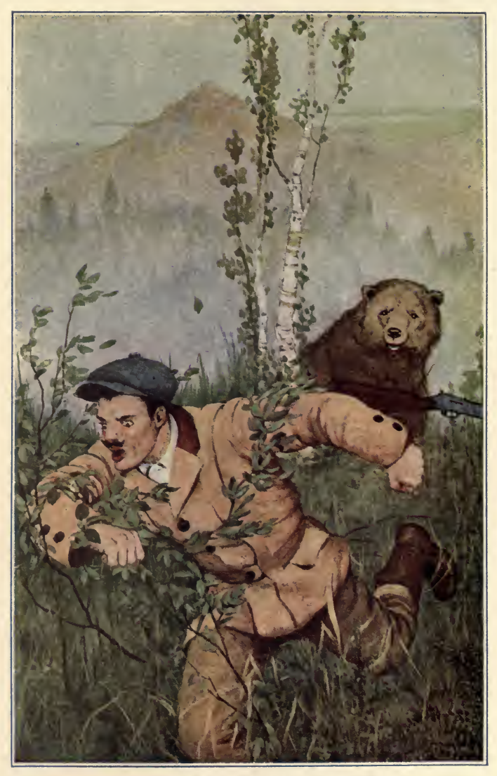
Of course he dropped his gun.-Page 107.