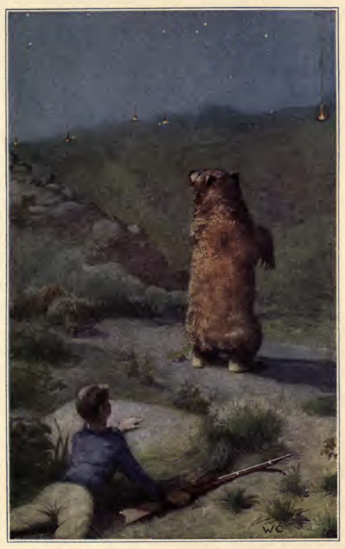
He threw his enormous bulk back on his haunches, and rose up.—Page 40.