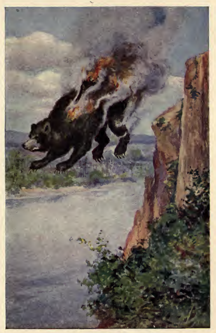
Into the water leaped a black bear.—Page 26.