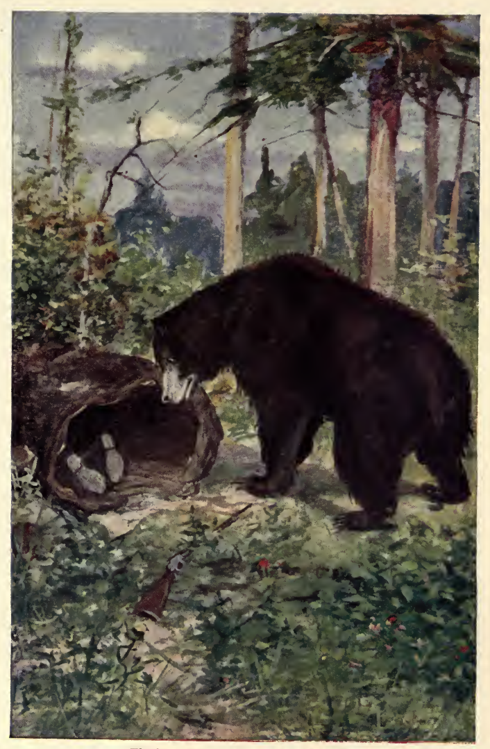
The bear was waiting there.-Page 111.