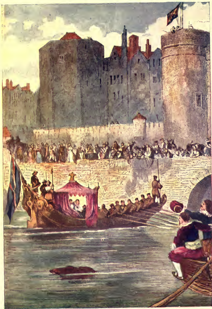
THE BISHOPS SENT TO THE TOWER.